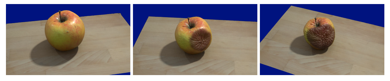
Figure 1: Apple decay simulation.

<sup>1</sup>The National Centre for Computer Animation, Bournemouth University, UK